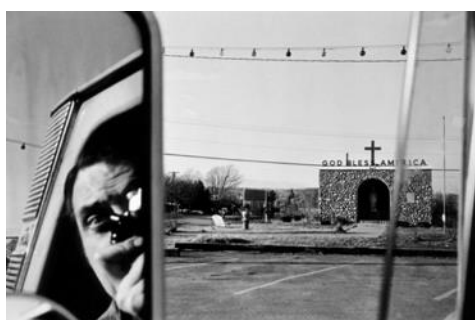
Lee Friedlander - Route 9W, New York, 1969