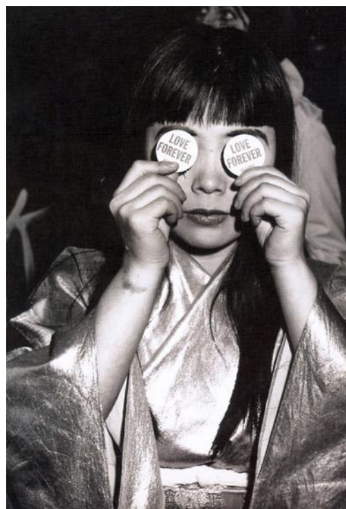
Yayoi Kusama - Self-portrait, 1966