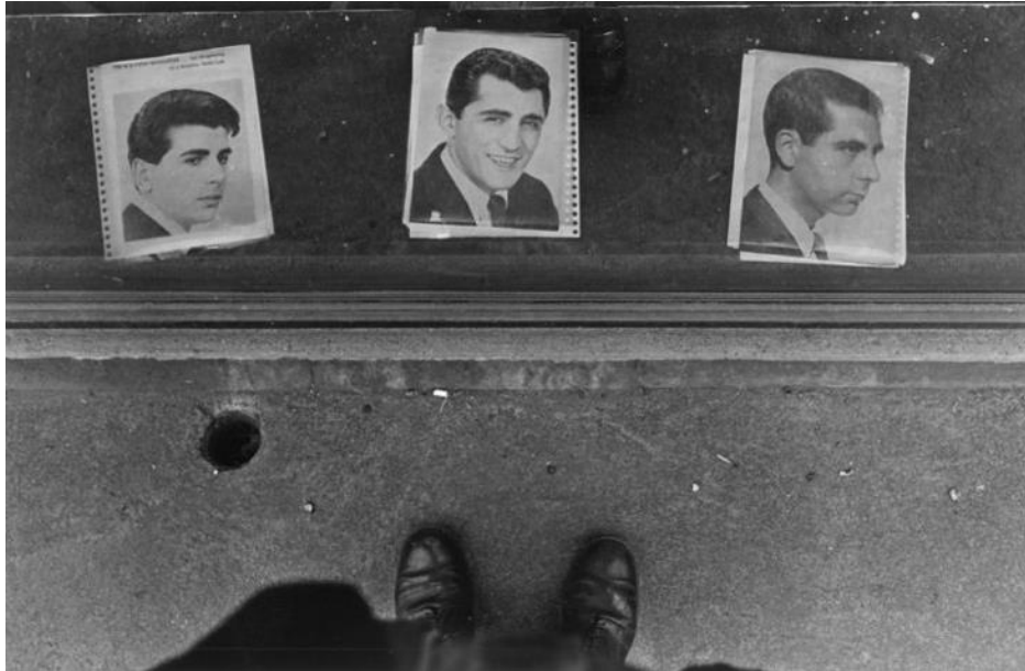
Lee Friedlander - Albany, 1967

Most Selfies concentrate on the face but why can't a Selfie represent another part of the anatomy? Take a look at these unusual self-portraits and experiment with your own Feet Selfies. You could use your feet and someone else's head. Or, if you're really clever, you could try to get a foreshortened version of your own face and feet into the same photo, like Harry Callahan.