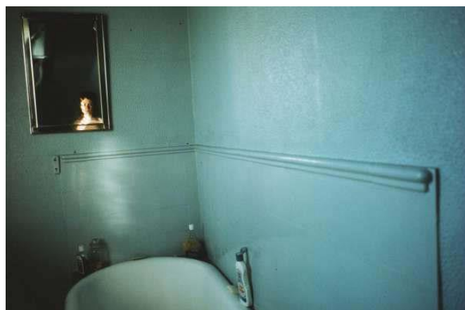
Nan Goldin - Self Portrait in Blue Bathroom, London 1980