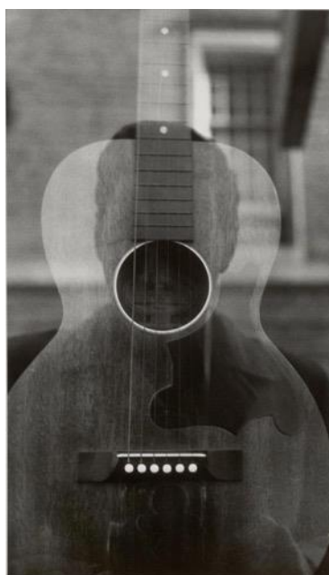
Ralph Eugene Meatyard - Untitled (Self-Portrait with Camera and Guitar), 1955