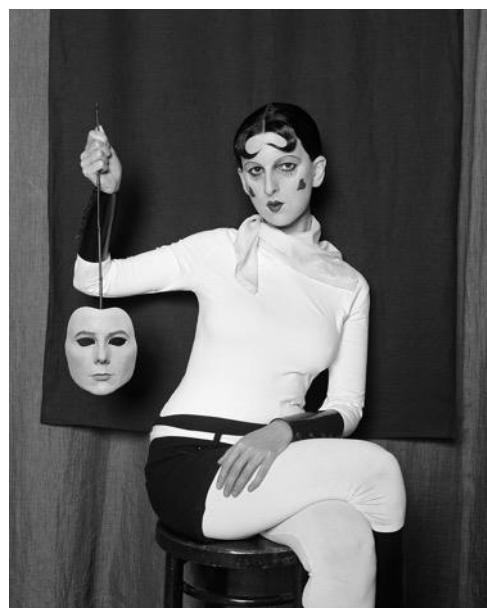
Gillian Wearing - Me as Claude Cahun Holding a Mask of My Face, 2012