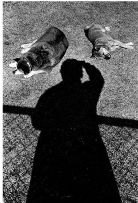
Daido Moriyama – Self-portrait with dogs, 1997