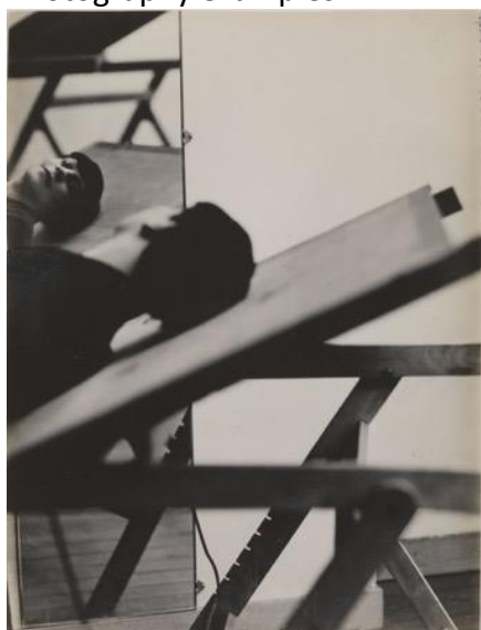
Florence Henri – Self-portrait in mirror, 1928