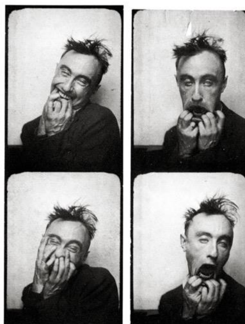
Yves Tanguy - Photomaton, Paris, 1928.