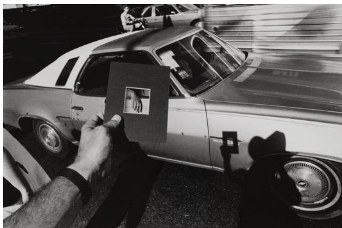
Kenneth Josephson - Chicago, 1980