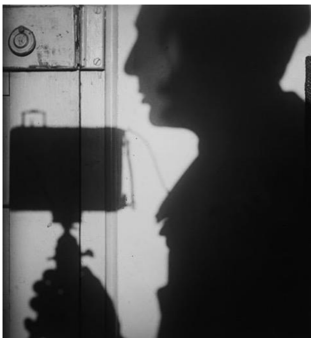
André Kertész - Self-portrait, Paris, 1927