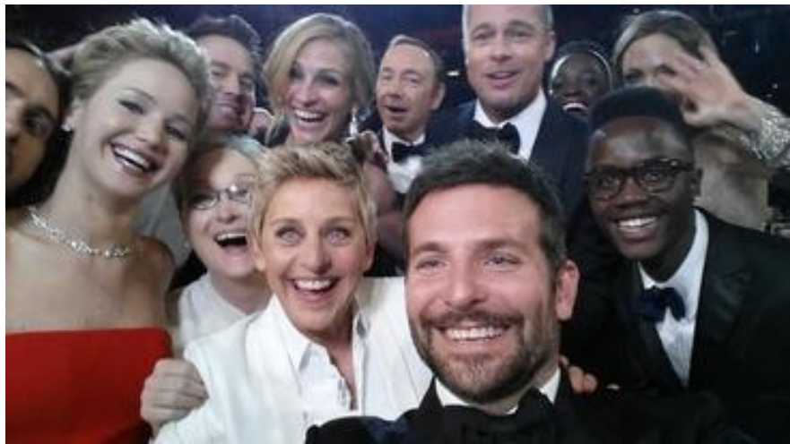
The most shared Selfie to date with over 3 million re-tweets

On 30 March 2017, the Saatchi Gallery in London launched an exhibition entitled From Selfie to Self-Expression , claiming it to be "the world's first exhibition exploring the history of the selfie from Velazquez to the present day, while celebrating the truly creative potential of a form of expression often derided for its inanity."