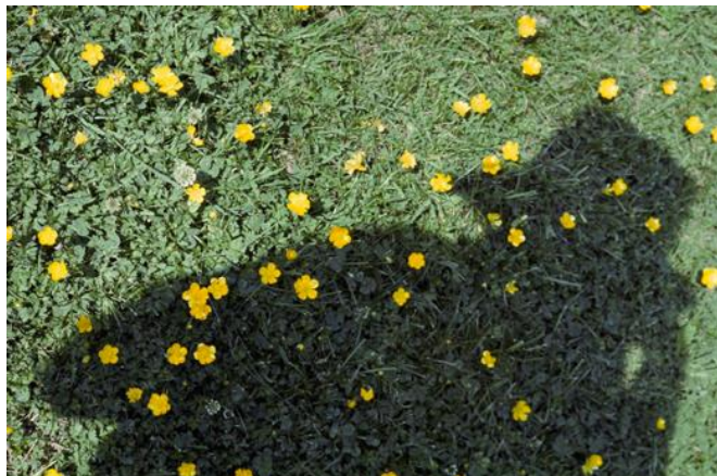
Vivian Maier, 1975

A shadow is like a photograph of ourselves, an image made by light (and the absence of it). Photographers are particularly sensitive to effects of light and so have long been interested in their own shadows. Experiment with your own Shadow Selfies, exploring a variety of effects and compositions.