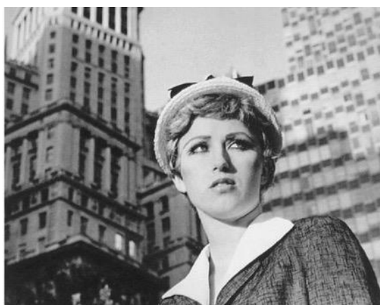
Cindy Sherman - Untitled Film Still #14, 1978