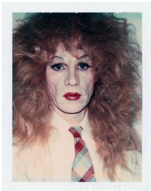
Andy Warhol - Self-portrait in drag, 1981

Artists and photographers have always enjoyed playing with the image of themselves, experimenting with costumes, make-up, poses and lighting to transform themselves into a wide range of characters. Look at the examples below and research those you find interesting. Attempt your own experiments with the Disguised Selfie. Could you change your gender, become a character from a favourite film, turn your back to the camera or become a famous work of art?