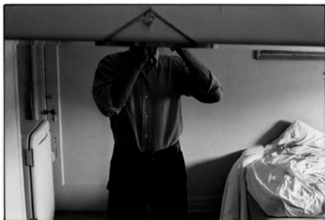
William Gedney - Self-portrait with head obscured, 1969

Associated with the Disguised Selfie, there are several examples of photographic Selfies in which the subject's face is obscured. The camera flattens three-dimensional space so that something in the foreground can appear to be on the same level as something else in the background. Of course, some of the obscuring can be done after the fact. Look at these examples and then experiment with making your own Obscured Selfies.